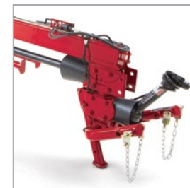
Two-Point Swivel Hitch